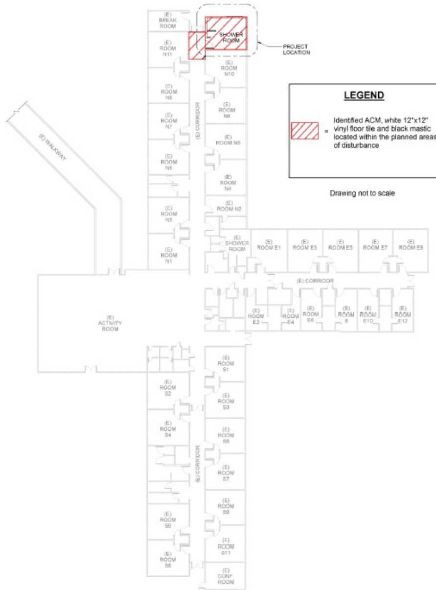
Figure 1. Site Layout and Location of Identified ACM Hilo Medical Center – Extended Care Facility New Shower Hilo, Hawaii